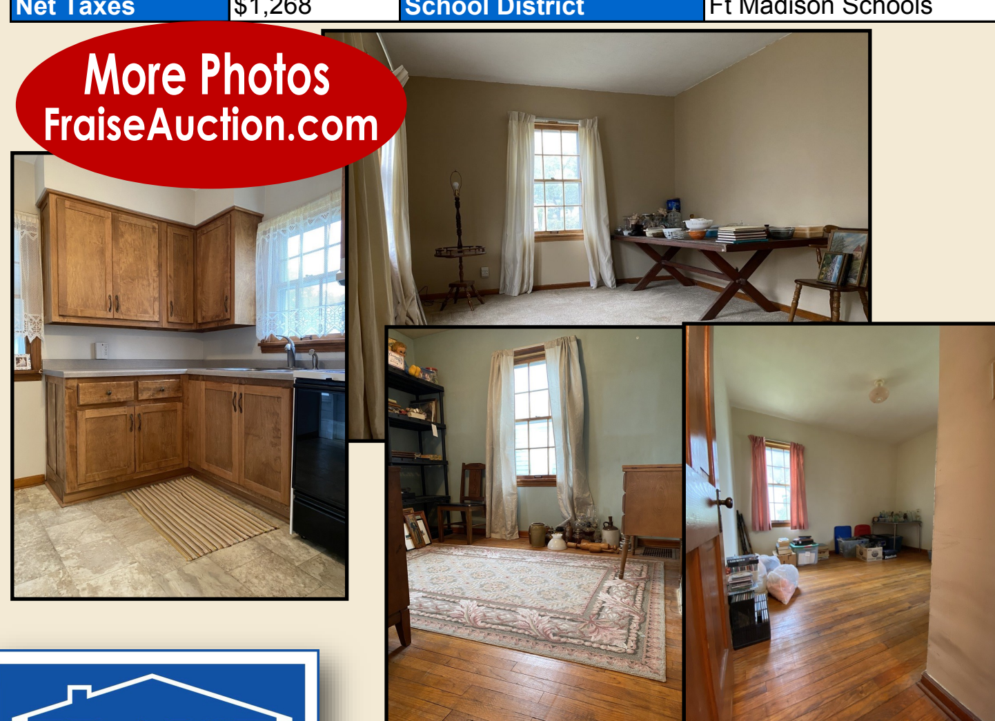
Bid Now at FraiseAuction.com